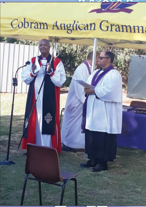
Trinity Anglican College Yr 12 Final Service